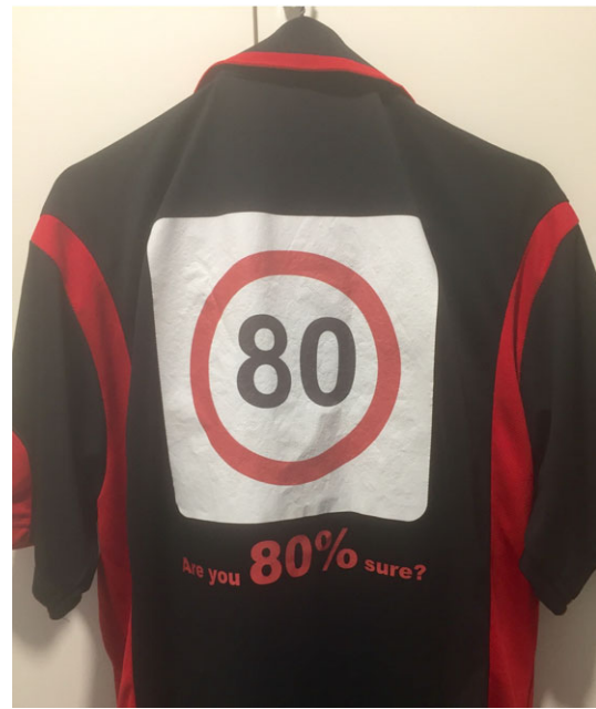
Figure 1. Credit shirt.

This study aimed to estimate PIVC insertion and use with high precision and detect a reduction in rates of placed and unused cannulas. Based on local audit findings we estimated that 65% of our ED patients have a cannula placed. Prior research has shown that 50% of PIVC are unused. 3 To obtain precision of 3% and confidence level of 95%, we required 972 patients in each of the pre- and post intervention periods to estimate the proportion inserted and 1,068 patients in each of the pre- and post intervention periods with cannula placed to estimate the proportion unused